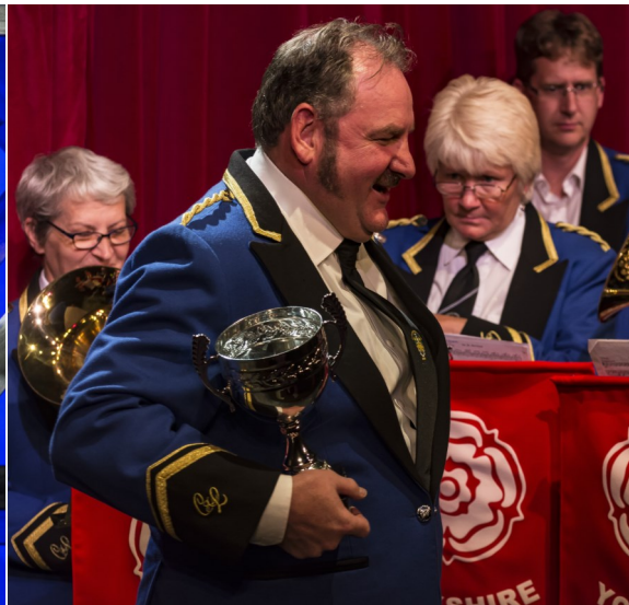
Winning the National Finals