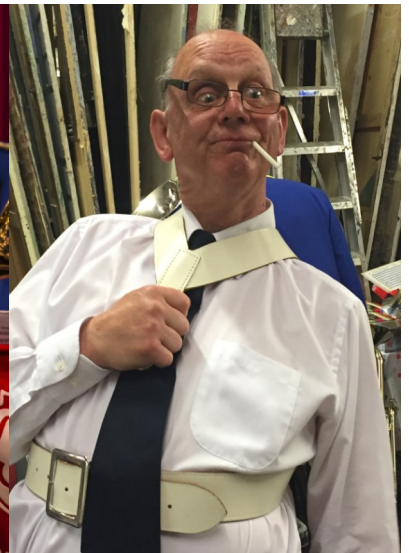
Saddleworth round 3—Oh dear !!